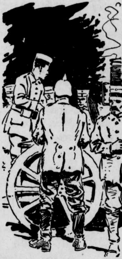
Field Kitchens Were Near By.

and retire to nearby heights and occupy new defenses. With that he turned around and pointed to a ridge on the horizon.