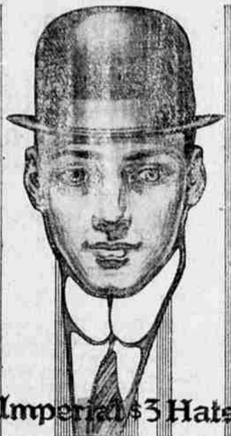
Imperial $3 Hats

Office in Aikin Plumbing Co.'s Store, Medford.