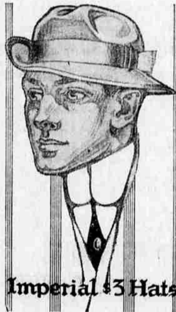
Imperial $3 Hats

IF We can't please you with one of the above hats, it's because you won't let us. We have a style for every man, no matter how tall, how broad, how small or how thin. In every color that is new. Come in and have a look. You are always welcome at the quality store.