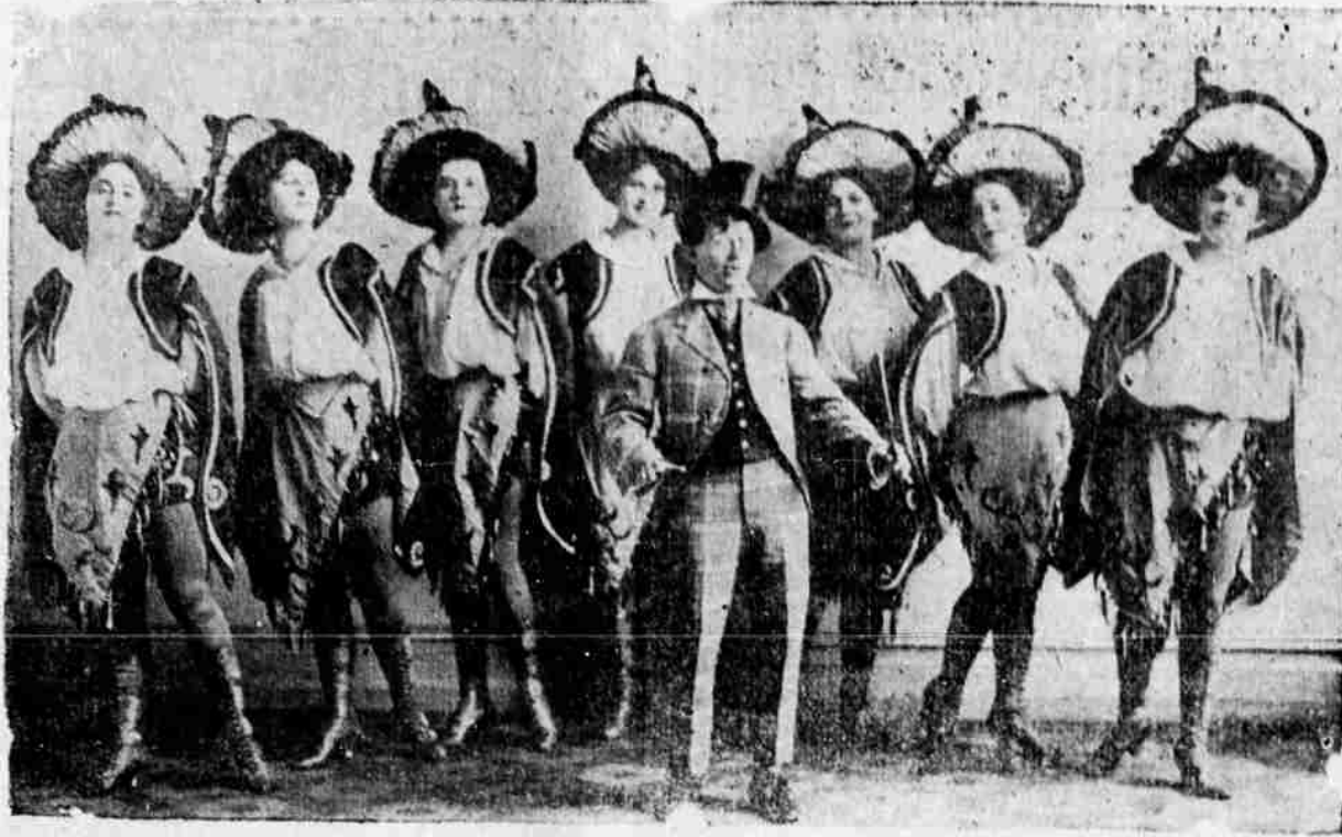
BEAUTY CHORUS TO APPEAR IN "A KNIGHT FOR A DAY" THURS. DAY EVENING.

WANTED—First-class 6-mule teamster. See Price, the blacksmith.