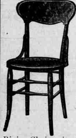
Dining Chairs, similar to above; sale $2.75

This is your opportunity. It may never come again. Act now.