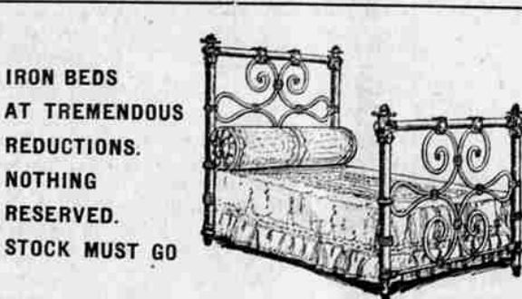
$25.00 HEAVY BRASS BEDS. WHILE THEY LAST.

Large assortment; beautiful designs and grains of solid $14.35