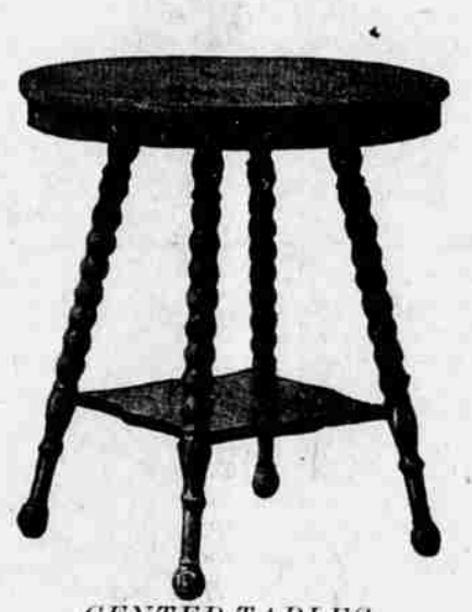
CENTER TABLES Round or square. Big assortment. Sale prices from

There Isn't a home in Medford but what needs new or better furniture. Wonderful opportunity for hotels and rooming houses. EVERYTHING GOES NOTHING RE= SERYED. Don't expect to see everything advertised here and don't wait until everythiug has been picked over. Be nere tomorrow morning when the doors open at 90'clock