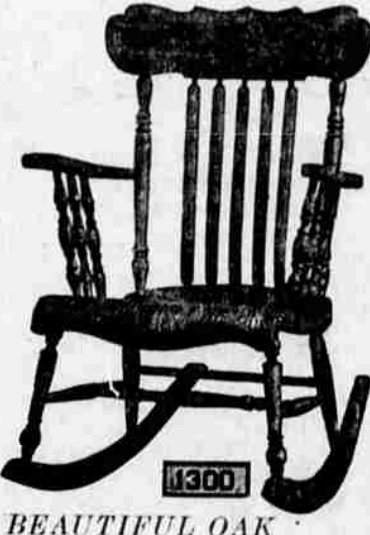
ROCKER Like illustration; sale price

Greatest bargain of all. Only a few left. While they last: $6.85