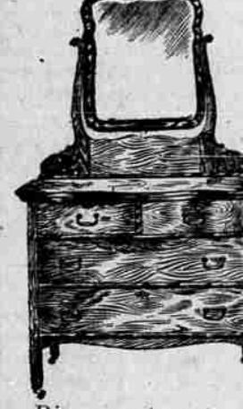
Big assortment of Dressers and Chiffon-