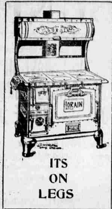
ITS ON LEGS