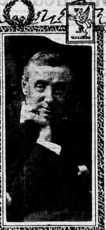
THOMAS JEFFERSON OF THE FIFTH GENERATION IN "RIP VAN WINKLE"