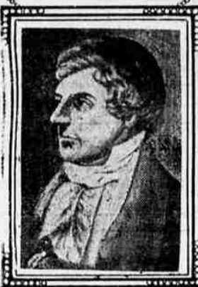
JOSEPH JEFFERSON JEFFERSON THE THIRD