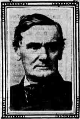
JOSEPH JEFFERSON FOURTH IN THE FAMILY LINE OF ACTORS AND WHO RECENTLY PASSEDD AWAY