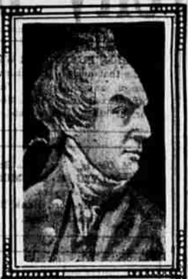
JOSEPH JEFFERSON SECOND OF THE GENERATION OF JEFFERSONS