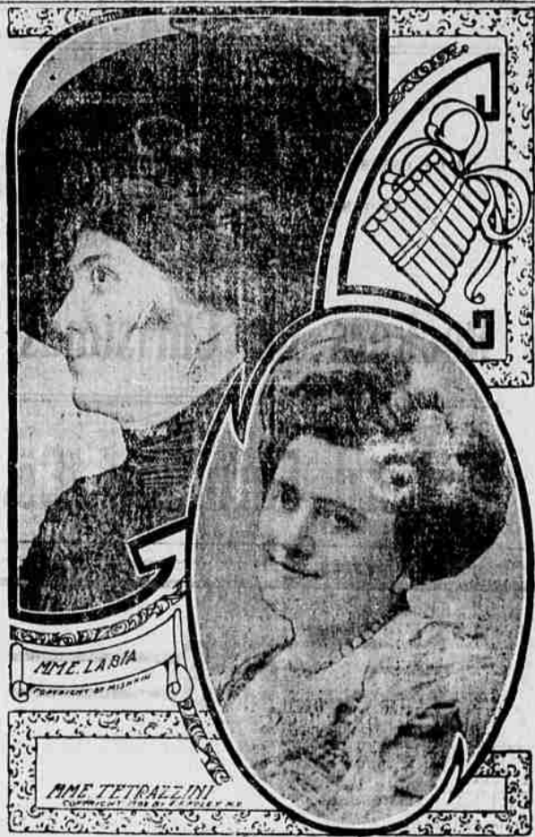
MMES. LABIA AND TETRAZZINI, NOTED PRIMA DONNAS.

In Mmes. Labia and Tetrazzini the Manhattan Opera House, New York, commands the services of two of the greatest prima donnas living. Mme. Labia upon the occasion of her recent American debut was heralded as the greatest dramatic soprano in the world. Her receptions so far seem to justify this statement, to some extent at least. Mme. Tetrazzini has lost none of her popularity. She is greeted by a most enthusiastic audience at every appearance, and she declares she would rather sing to Americans than any people she ever has appeared before.