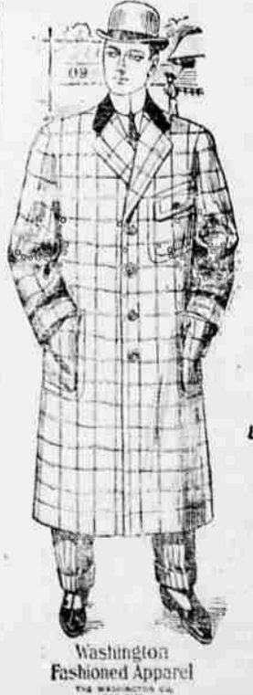
Washington Fashioned Apparel

Other Bargains Unfinished worsted Cravenette Overcoat; extra fine workmanship; 1-3 silk lined; heavy satin sleeve lining; great value; others sell for $35.00; our price ..... $27.50 Full lines of men's working garments. Gloves, Shirts, Underwear etc.; the largest stock in Southern Oregon to select from. Medford's Greatest Value Givers.