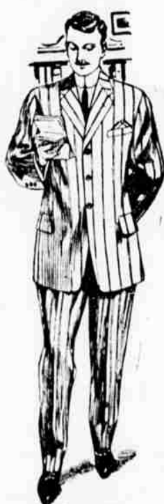
Washington Fashioned Apparel

OUR UNDERWEAR WON'T SCRATCH OR ITCHE, BUT THE PRICE WILL TICKLE YOU. ASK TO SEE OUR HEAVY COTTON 50-CENT GARMENT.