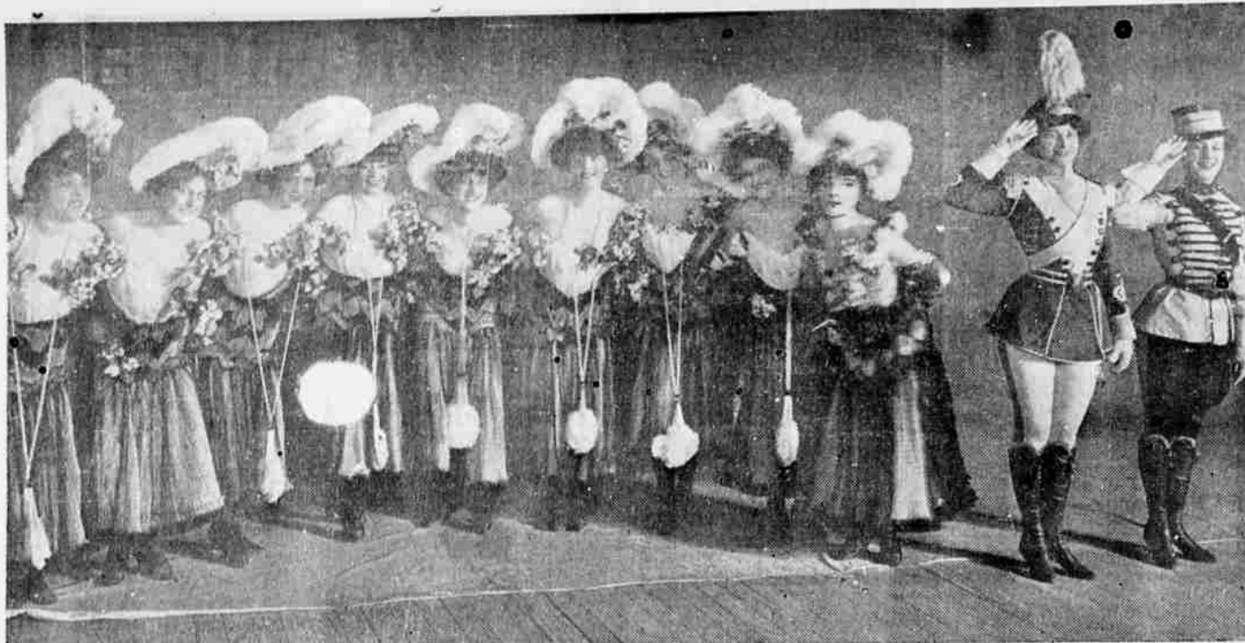
A GROUP OF SHOWGIRLS WITH "THE TOYMAKER."