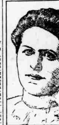
MRS. BELLE GUINNESS. Woman whose numerous murders on her Indiana farm have horrified the whole world.

La Porte, Ind., May 16.—Seven thousand dollars has been appropriated by the county commissioners as a reward for the arrest of Mrs. Belle Guinness, if she is alive. The