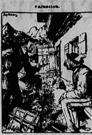
Artist—How much for the glass of milk? Peasant—Oh, nothing much! You might just paint me a little picture for it!—Fliegende Blätter.

The Beginning of Knowledge. "You really don't believe, then, that a man is ever too old to learn?" "Certainly not. I've known men to get married at the age of seventy-five or more."—Philadelphia Ledger.