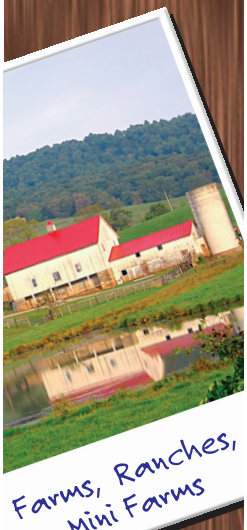
Farms, Ranches, Mini Farms

Having trouble finding that perfect piece of property?