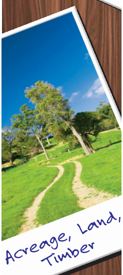
Acreage, Land, Timber