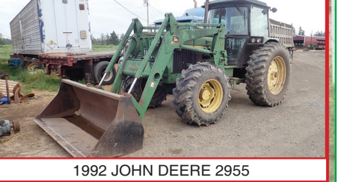
1992 JOHN DEERE 2955