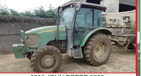
2006 JOHN DEERE 5525

Public Online Auction Coelho Dairy Farm & Dairy Equipment Start Date: 11am | Sept. 14 Close Date: 11am | Sept. 21 Preview: 8am - 4pm | Sept. 20 18624 Arbor Grove Road NE., Woodburn, OR 97071