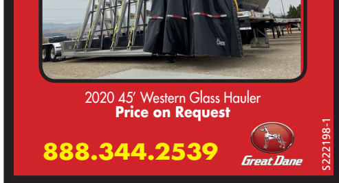
2020 45' Western Glass Hauler Price on Request 888.344.2539