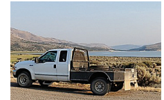
FLATBED ONLY: 8ft by 8ft steel, multipurpose, can use to haul hay or welding equipment, comes with sideboards, $2,500 Juntura, OR. 541-604-5187