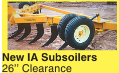
New IA Subsoilers 26" Clearance •3 Shank $2,995 •5 Shank $3,795 •7 Shank $4,895 Gauge Wheel Set, Add $995. •HD Subsoilers with Dual Gauge Wheels. Weight 4,500 to 5,500 lbs. 30" Clearance. •7 Shank $11,995 •9 Shank $12,995 •11 Shank $13,995 Bend, OR. 541-548-7185 mtcsales.net