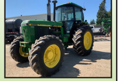
1990 John Deere 4255, MFWD, 133 hp, Power-shift, 6241 hours, 3 remotes...$36,000

ALSO AVAILABLE: (2) 1988 John Deere 4250's 1987 John Deere 4450 1990 John Deere 4255 1989 John Deere 4255 1980 John Deere 4240 Find lots more equipment at: www.TJEquipmentLLC.com