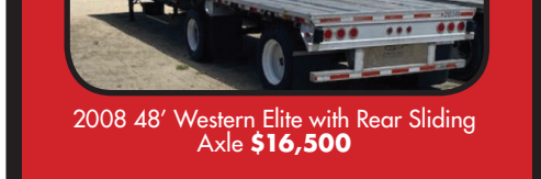
2008 48' Western Elite with Rear Sliding Axle $16,500