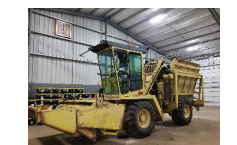
Pixall Beanstalker Bean Picker, $19,500. St. Paul, OR. 503-932-8618