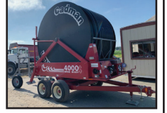
NEW Cadman 4000SWB irrigation reel, 4"x1250' hose, 443-600 GPM...$42,000 $37,000