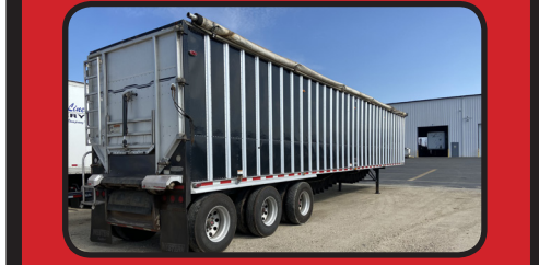
2016 50' Western Express Tri-axle $54,900

WWW.WESTERNTRAILER.COM ALL TRAILERS IN STOCK & READY FOR DELIVERY!