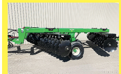
NEW IA Super Duty Offset Wheel Discs. EZ Adjust Gang Angle. 30" notched blades front and rear, adjustable scraper kit, 2" gang shafts, split gang shafts, high clearance. 9,000 to 12,000 lbs. •12ft $31,900 •14ft $33,900 •16ft $35,900 •21ft $40,900 •10ft to 25ft Bend, OR. 541-548-7185 mtcsales.net