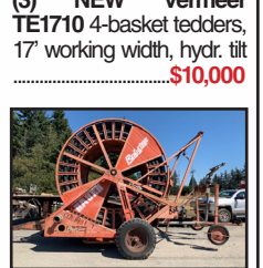
Bauer Rainstar irrigation reel, 4" hose, gun cart, single axle, 8.25-20 tires...$8,200 $7,100