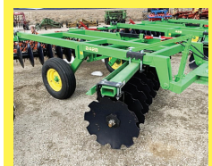
NEW IA Tandem and Offset Wheel Discs. •7ft $6,995 •8ft $7,395 •9ft $7,795 •10ft $8,195 •11ft $8,495 •12ft $8,795 •13ft $8,995 Bend, OR. 541-548-7185 mtcsales.net