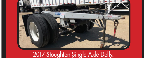
2017 Stoughton Single Axle Dolly, Spring Ride $5,250