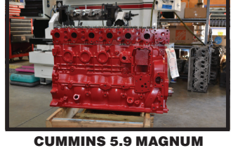
CUMMINS 5.9 MAGNUM