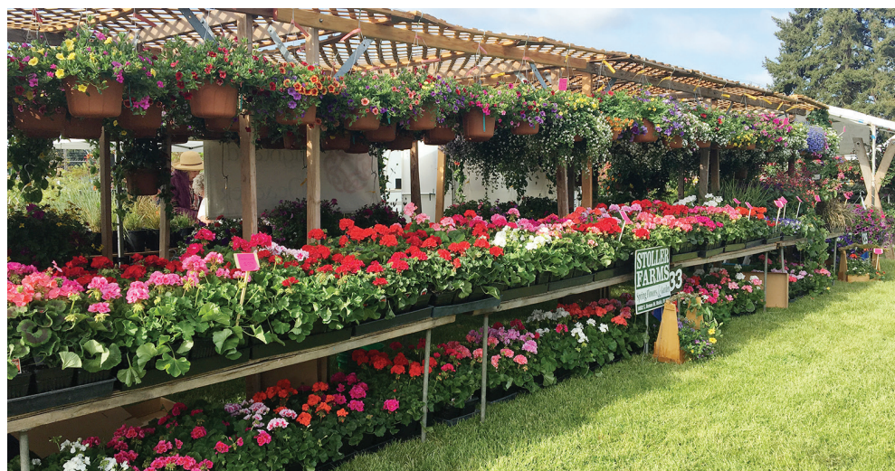
Stoller Farms is a regular at area farmers markets and other events.

Marvin Stoller had a turkey farm from 1979 until 1992 when the bottom fell out