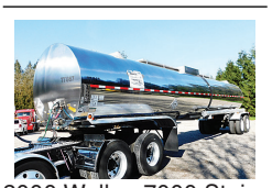
2000 Walker 7000 Stainless Tanker Trailer, Food Grade, Insulated, NICE, $27,500 Wilsonville, OR. 503-260-0303

Miscellaneous 3 axle equipment trailer, 20ft semi pull trailer, 45ft storage vans, (2) 1980 diesel trucks, 1 Bartlett 5th wheel, 2 fork lifts, Salem, OR. 503-507-6532