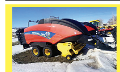
2013 New Holland Big Baler: 340 NH- (Bales 10,000), Moisture Meter, Bale Chute Extension, Bale Chute Skis, Scales. Camera on back and folding bale chute. Ready to go. One Owner. Excellent Condition, $64,000. Southeastern OR. 541-219-0741