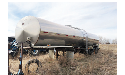
Water Hauling Trailer for large acreage spraying, 6000 gallon, hydraulic driven pump, heater unit for winter use. Insulated stainless steel, 2 compartments. $9,000. Meridian, ID. 208-888-1376