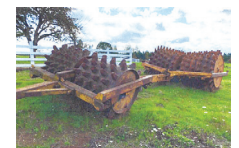
Compactors: 4'x4', $5000. 5'x5', $7500. Salem, OR. 503-559-3186

RETIRING Pile Driver: Fits 350, 450, 550 John Deere sized dozers, good condition, 13ft leads, 1100lb hammer, $2500 OBO. John Deere backhoe bucket, 36in wide, $300 OBO. LB 4 slope laser level. Like new condition, $1500 OBO. Langley, WA. 360-321-1624