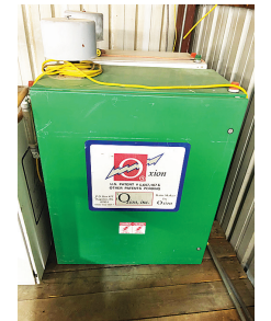
Oxions (4)-12 cell/ unit, clean, great shape $3500/ each. Meridian, ID. 208-888-1376