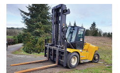
2017 Yale: 360K capacity. New rubber. 10K hours. 8ft. forks. Hydraulic fork positioners. Side shift, 183" upright 2 stage mast. Cummins 5.9. AC, full cab, $85,000. Gaston, OR. 503-789-3726