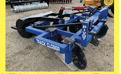
NEW IA Pivot Track Closer. Heavy Duty with adjustable cone discs. From 60" to 12" closing width. Hydraulic Depth Control water fill roller packer, $4795. Bend, OR. 541-548-7185 mtcsales.net

800ft 4" Wade Mainline. Beaverton, OR. 503-516-4446