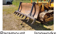
Paramount Ironworks has new brush rakes. We can help your land clearing/ clean up operations. The 8ft rake pictured will fit a variety of dozers and has 1"AR400 rippers, $1750 and up. If you need something different, we offer custom fab & mobile welding. Let us know how we can help you. Eugene, OR. 541-321-3654

Wanted to Buy: used log skidder. 541-258-5422