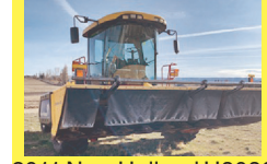
2011 New Holland H8080 Swather: with 416, 16' disc bine header. Deluxe cab electric mirrors, 1900+/- hours. Good condition, field ready. One owner, $68,000. Southeastern OR. 541-219-0741