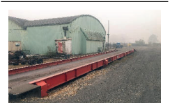
Unitec Truck Scale. Steel deck 90x10. 1 owner. Low profile portable 3 section. Salem, OR. 503-910-4010 westernag@msn.com

TRUCK SCALE: 120ft, concrete deck, certified. Canby, OR. 503-803-1926