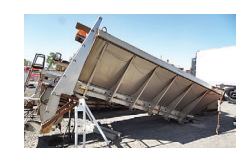
2004 Swenson Stainless Steel sand and compost distribution bed. 13ft. Complete with control box. Worked fine when taken out of service this year. Excellent condition and is ready to mount and go to work, $4500. Located in Twin Falls ID. Call 208-613-0050