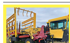
New Holland Bale Wagon H9880. Has 4720 miles or 749 hours. Big bale clamp and little bale chute. Excellent Condition. One owner, $155,000. Southeastern OR. 541-219-0741