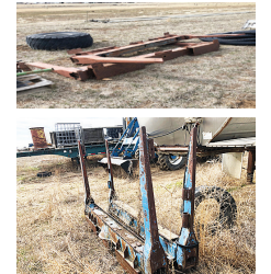
(2)Pipe & Pole Hauling Units $350/ set Meridian, ID. 208-888-1376

Wade Rain 1/4 mile-Wheel Lines. Some 5 foot wheels & some 7 foot wheels. Forest Grove, OR. 503-310-2524