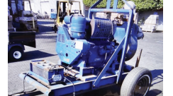
1998 Gorman Rupp 6 in. self priming waste and irrigation pump. Trailer mount. 432 ACTUAL HOURS. 4 cylinder. Deutz Diesel. Former City machine in like new condition, $9900. Located in Twin Falls ID. Call 208-613-0050

5"x30ft aluminum mainline with valves, $1.75/ ft. 6"x30ft aluminum mainline with valves, $2.00/ ft. 6"x50ft aluminum mainline with valves. $2.00/ ft. Moses Lake 509-750-7918