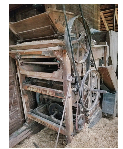
1942 Number 16 Clipper Cleaner with numerous screens Operates. Make an offer. Amity, OR. 503-314-3382

"JOHNNY POPPER" John Deere Tractor A, A-3703-R on engine block, 654939 serial number on frame. Needs restoration. VHS Engine Rebuild video included, $500. Ontario, OR. 814-548-6374