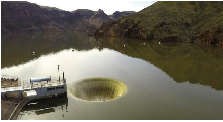
The "glory hole" at the Owyhee Reservoir funnels excess water into the spillway and out into the river below the dam.