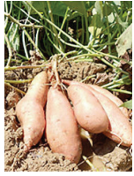
Sweet potatoes ready for harvest.