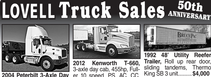
2004 Peterbilt 3-Axle Day Cab, Cummins, 10 speed, 3.90 gears, PS, AC, CC. Air fairings can be easily removed ......$12,500