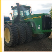
JD 9200 1997

Standard cab, 24 spd trans, 1000 PTO, 4 remotes, 18.4-42 Triples, 11,103-hrs, #0H001070 -Located in Walla Walla