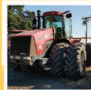
Case IH STX375 2005

Deluxe cab, PS transmission, 4 remotes, 3pt hitch, no PTO, 620-42 duals, 5,177-hrs, #E0107240 -Located in Salem