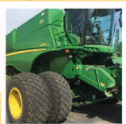
JD S680 2012

Sm Grain, Rohco 35% leveler, Drive duals, JD 635F platform and cart, 1,757-hrs, #C0745834 -Located in Colfax