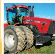
Case IH 435HD 2008

Deluxe Cab, PS transmission, 5 remotes, bareback, 710-38 duals, 8,493-hrs, #7F108048 -Located in Hillsboro