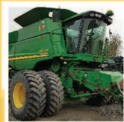
JD 9870 2009

Sm Grain, Hillico 28% leveler, 635F flex platform and cart, 2,421-hrs, #0S730647 -Located in Moscow