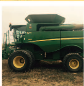
JD S680 2013

Hillico 27% leveler, duals, 4WD, Straw chopper, MacDon header harness, 1,116-hrs, #D0756086 -Located in Tekoa