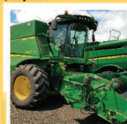
JD S660 2013

Premium Cab, Small wire concave, vari stream rotor, JD 615P BPU platform, 1,263-hrs, #D0755808 -Located in Tangent