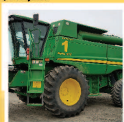
JD S670 2008

Premium Cab, Small wire concave, JD 615P BPU platform, 3,006-hrs, #0S726053 -Located in Tangent