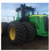
JD 9560R 2013

Premium cab, PS trans, 4 remotes, 1000 PTO, 800-46 Opti-Trac duals, 930-hrs, #7998 -Located in Four Lakes