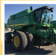
JD S670 2009

Rahco 35% leveler, duals, 4WD, Straw chopper, JD 615P platform and cart, 2,335-hrs, #0S730229 -Located in Colfax