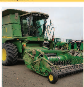
JD S660 2004

Sm Grain, Bullet Rotor, JD 615P belt pickup platform, 3,479-hrs, #0S706470 -Located in Tangent