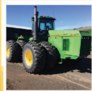
JD 8770 1996

Standard cab, 24 spd trans, Bareback, 4 remotes, 24.5-32 duals, 8,493-hrs, #0H004622 -Located in Tekoa