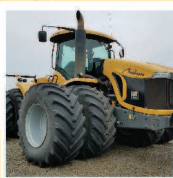
Challenger MT955B 2015

Premium Cab, PS trans, 6 remotes, bareback, 800-42 duals, 2,001-hrs, #NTSG1040 -Located in Harrisburg