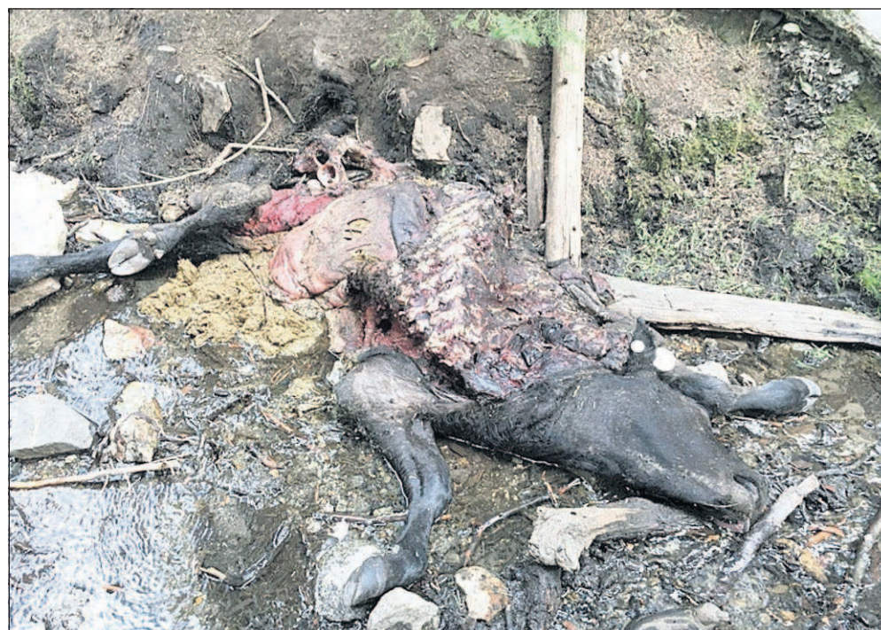
Washington Department of Fish and Wildlife

Capital Press was unable to reach a representative of Norcal Nursery as of press time.