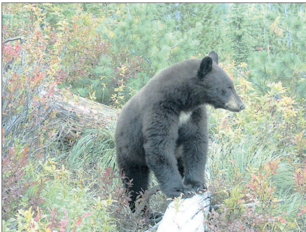
Idaho Department of Fish and Game

“It’s an easy, fast food source for them, and they don’t have to work very hard at it,”