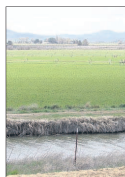
A Klamath Basin irrigation canal. Snowpack and water levels in the Klamath Basin were at 28 percent of average in late February, prompting the Klamath County commissioners to declare a drought emergency.