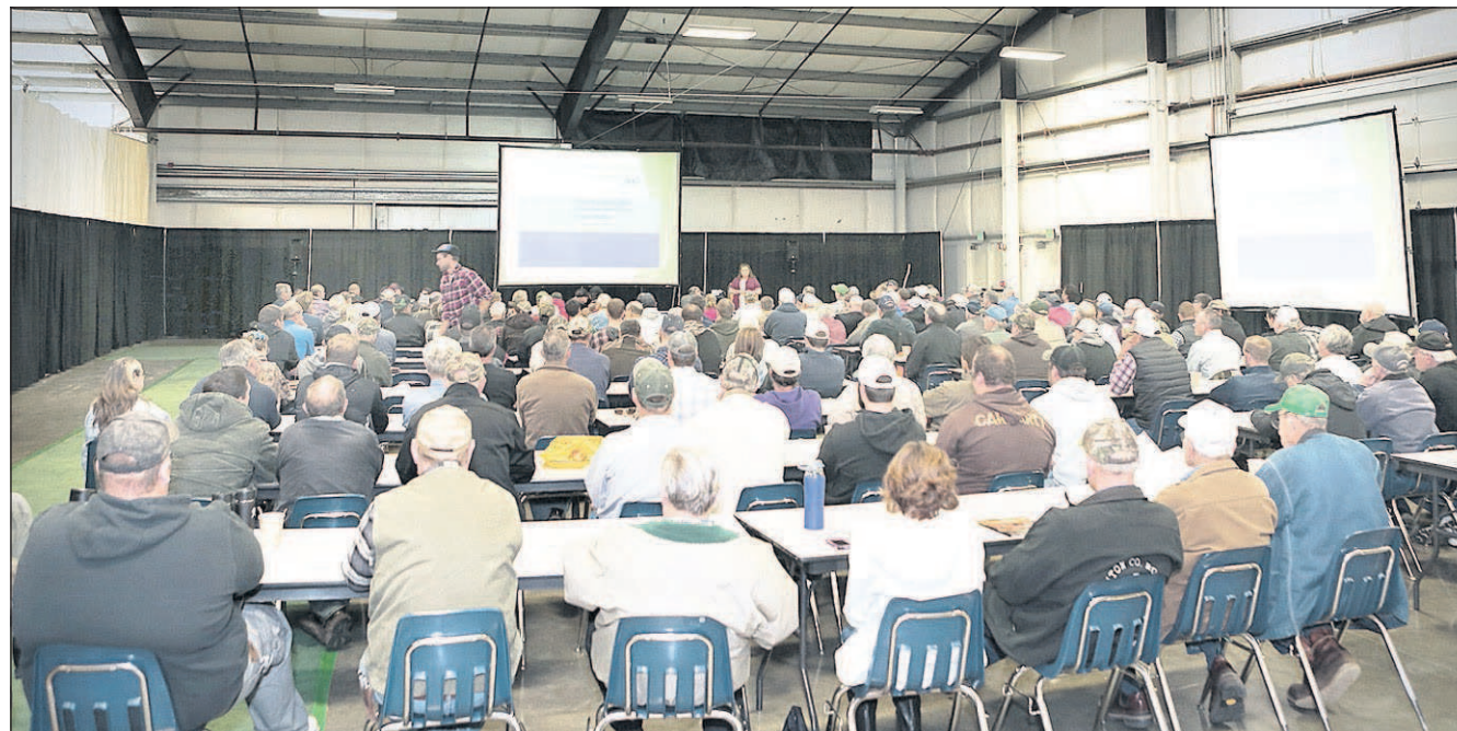
Large crowds attend the seminars and classes at last year's Willamette Valley Ag Expo.

Course description: There is concern about the impact of pesticides on pollinating insects, and new state and federal regulations around pesticide use and pollinators. This session will have an easy-to-apply set of rules to help attendees judge how to