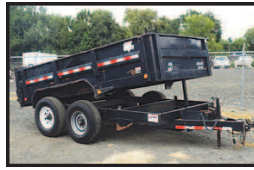
2004 PJ Dump Trailer