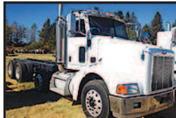
2006 Peterbilt Cab & Chassis, 4 Axle

• (4) BACKHOES: Cat 416, JD 110/300, MF 50 • (9) FORKLIFTS-MANLIFTS: JCB 506 Telehandler, 2 Hyster 8000lb, Snorkel, Grove • (1) CAT 12 GRADER • (1) BROCE SWEEPER BROOM: Dsl; • (4) 5 & 12 Yrd DUMP TRUCKS-Water Truck: 4000 Gal Water Truck • (8) 2 TON TRUCKS: 2008-1981 Bucket, Garbage, FB, Roll Off, Utility • (8) 1T TRUCKS: 2005-1967 Ford, Chevy, Dodge FB's, Utilities • (12) SEMI TRUCKS: Peterbilt, Freightliner, Mack Volvo, IHC • (13) SEMI TRAILERS: Great Dane, Frueh, 7-Sets Flat Trailer Doubles, Refer, Dry Vans, Step Decks • (26) PICKUPS-VANS-BUSES: 2008-1984 Chev, Ford, Dodge, Freightliner, IHC 3/4T, 1/2T, 4X4 • (12) CAR TRAILERS-BACKHOE TRAILERS • (26) SUV'S-AUTOS-SEIZURES: 2008-1992 Honda, Mitsubishi, Suzuki, Impala, Crown Vic, Explorer, Toyota, Dodge, Nissan, Cherokee, Liberty, Tahoe, Beetle • (14) ATV'S-CART-RV'S-CAMP TRAILER-MOWERS: 4 Wheelers, JD/Toro Commercial Mowers • (9) FARM TRACTORS: JD, MF, Ford, Farmall, 3Pt, some 4X4 w/Loaders • (50+) Farm, Orchard, Hay, Livestock Equipment-Irrigation-Lawn & Garden • (4) AIR COMPRESSORS-WELDERS-GENERATORS: Fencing, Lumber, Shop Equipment, Tools, Tires, County & School Surplus.