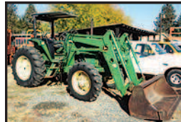
JD 6200 Tractor w/Loader 4X4