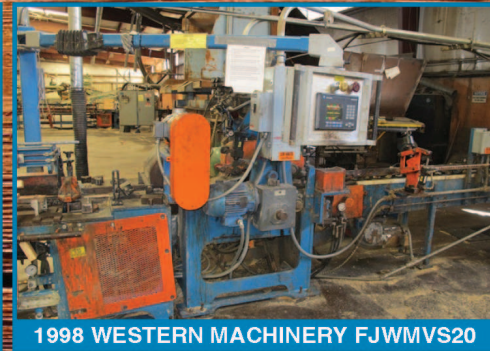
1998 WESTERN MACHINERY FJWMV520

James G. Murphy Co. Commercial & Industrial Auctioneers