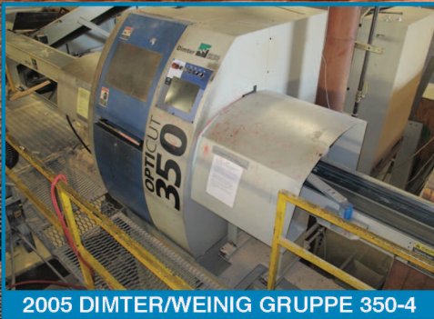
2005 DIMTER/WEINIG GRUPPE 350-4