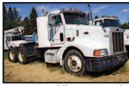
2001 Peterbilt Tractor Truck