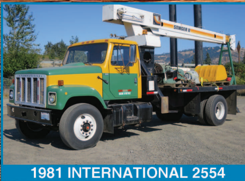
1981 INTERNATIONAL 2554

37385 JASPER LOWELL RD., JASPER, OR 97438