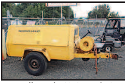
1985 Ingersoll Rand 160 CFM Air Compressor