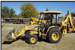
2001 JD 110 Backhoe 4X4, Dsl