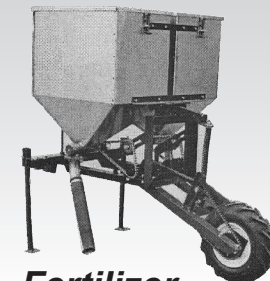
Fertilizer Side Bander