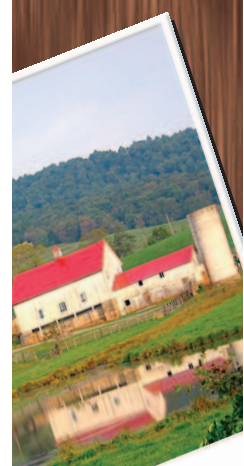
Farms, Ranches, Mini Farms

Having trouble finding that perfect piece of property?