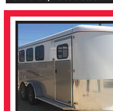
Royal T 3H Imperial X CALL FOR PRICE