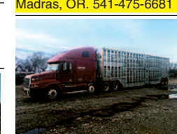
2004 48' LIVESTOCK TRAILER: Merritt, excellent condition including floors. Parma, ID. 208-250-5575

1998 Wilson Straight Deck Cattle Trailer: 53', 38' top, 26' belly, 15' step, 102" wide, 3 axle, $14,500. Madras, OR. 541-475-6681