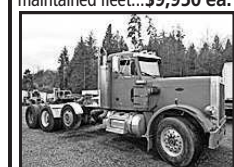
1980 PETERBILT 359 4 axle, NTC 400 Big Cam Cummins, Jake, 13 spd., Airride, 248"WB. Has alum. frame..... $9,950