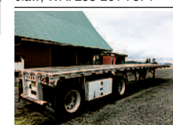
1996 Aluminum Flatbed Ravens Trailer: 45', spread axle, $8500. Junction City, OR. 541-998-1720

1 set A Trains: 1981, Trao, 40', 1980 3- axle, 24' Comet, $4000 OBO. 45' spread axle, nice, $4500. All offers considered Enum- claw, WA. 253-261-7874