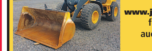
2014 John Deere 544k Wheel Loader

PREVIEW DAYS MAY 22nd-23rd, 2017 8:00AM-5:00PM