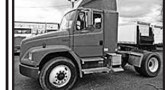
(5) 2001 FREIGHTLINERS FL70 148"WB, spring ride, 5 Allis- sons, AT's only 266,159 miles and came from well maintained fleet...$9,950 ea.