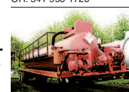
5460 Gallon Vacuum Tank Trailer: tandem axle Deutz diesel vacuum pump, $18,000. Dayton, OR. 503- 969-9545