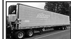
2001 UTILITY 53'X102' REEFER Has Carrier Ultima 53 unit with 8900 hrs. Airride slider swing doors, Cherry sale.....$7,950