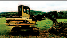
Cat 325B Log Loader: $65,000 OBO. Molalla, OR. 503-680-4051

621 CAT SCRAPER Updated with 3306 CAT Engine, 2517 hours, good rubber, good condition, $24,000. Wamic, OR. Call 541-980-8923 or mrcattle@hughes.net