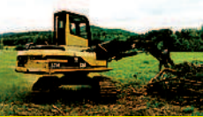
Cat 325B Log Loader: $65,000 OBO. Molalla, OR. 503-680-4051

621 CAT Scraper: $21,000. D7E blade with single shank ripper, $21,000. Excellent. Banks, OR. 503-324-4006