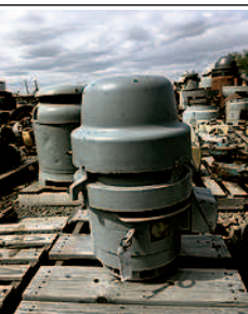
VERTICAL PUMP MOTOR Westinghouse, 30 HP, 1725 rpm, new bearings and reconditioned. Twin Falls, ID. 208-731-8310

VALLEY PIVOT 1973 Valley pivot, 120 acres, 10 towers, 21,600 hours, $12,000. Princeton, OR. 541-589-3123. Text or leave message if no answer.