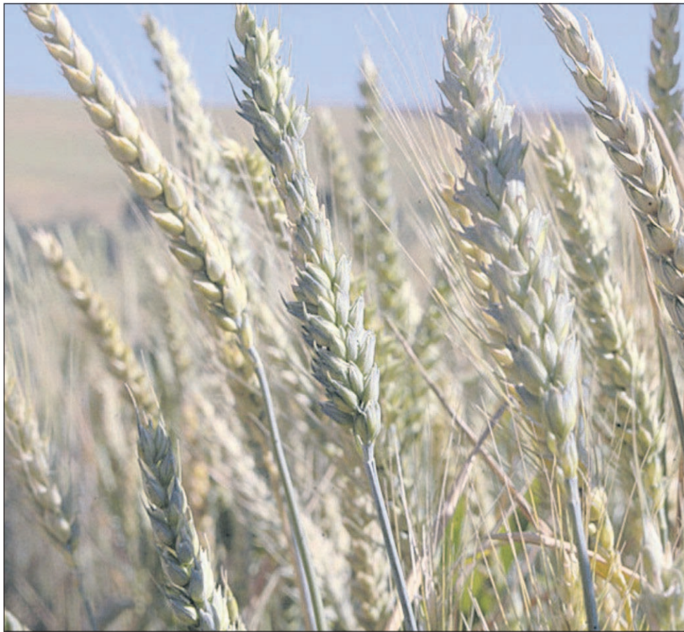
A new USDA supply and demand report indicates the worldwide wheat supply will remain stable, with less U.S. production and more in the southern hemisphere.

wheat price for U.S. growers remains at $3.85 per bushel from February. Soft white winter wheat ranged