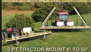
3 PT TRACTOR MOUNT 6' TO 50'