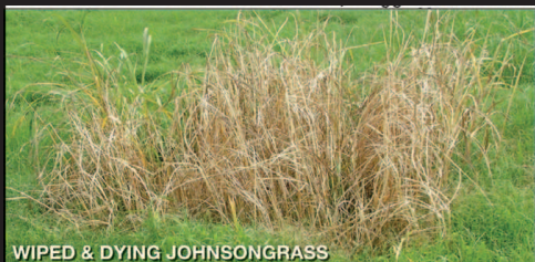
WIPED & DYING JOHNSONGRASS

"The Fast, Efficient and Economical Way"