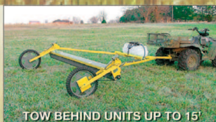
TOW BEHIND UNITS UP TO 15'