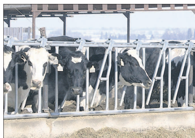
Cows at the Bokma Dairy take a sunny break on Jan. 30 after weeks of snow storms and extreme temperatures.

Getting around the dairy has also been challenging.