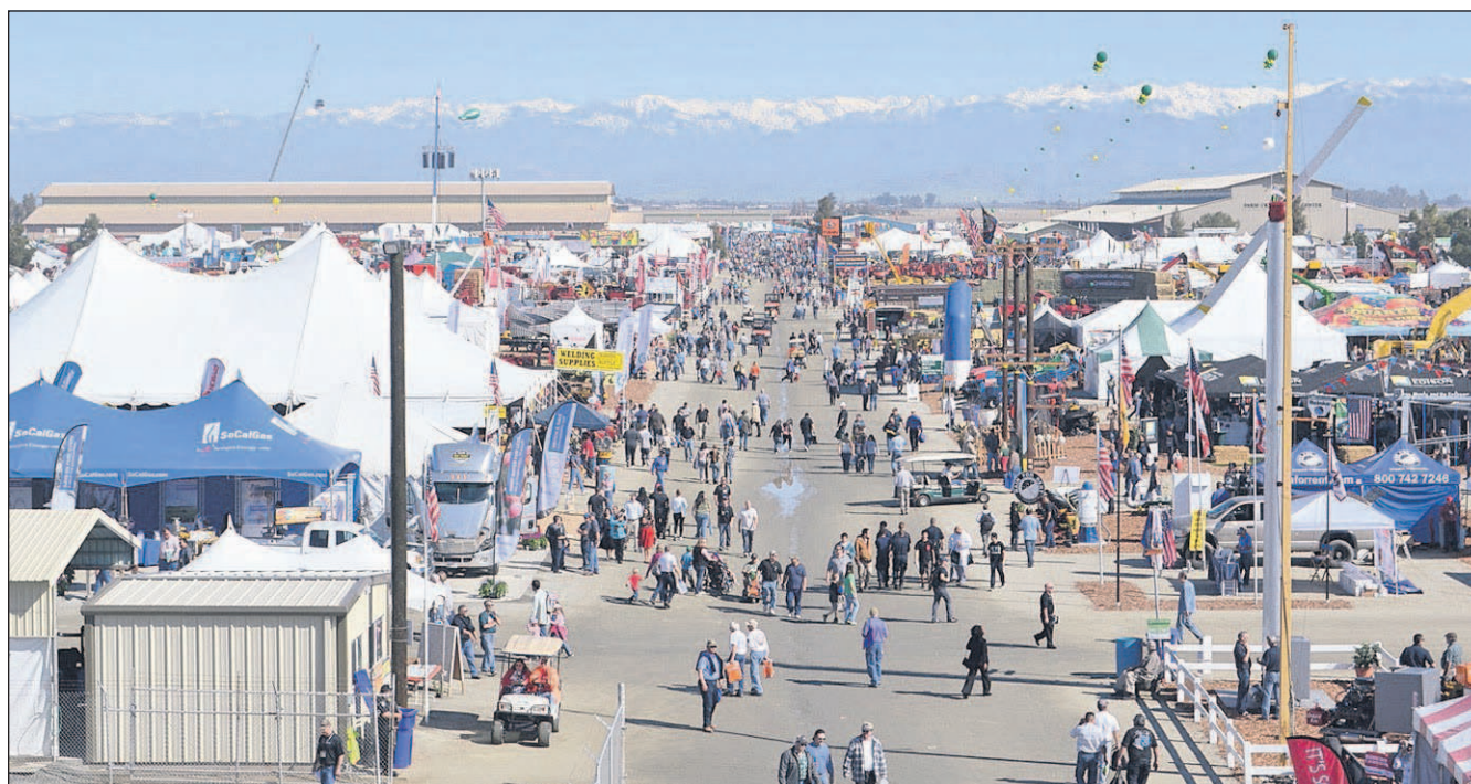
A view of the grounds at World Ag Expo 2016 in Tulare, Calif.