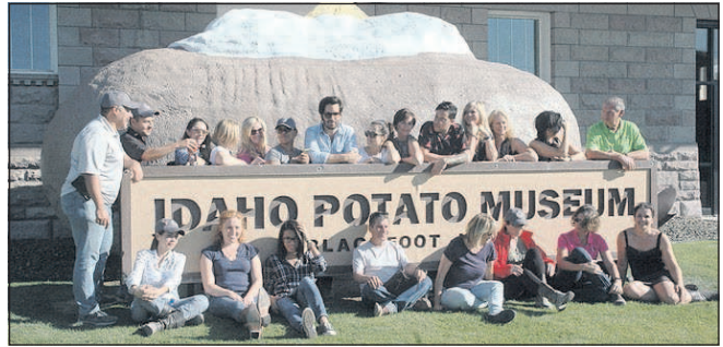
Food bloggers pose by the entrance of the Idaho Potato Museum in Blackfoot on Sept. 20. They were part of an annual tour showing the Idaho potato industry to food bloggers, including the tour's first international participants.

"The amount of work that goes into a single french fry, that's pretty amazing," Coraeo said. "When you think about fries — the ones that are