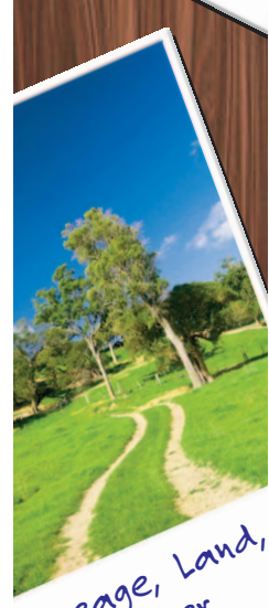
Acreage, Land, Timber