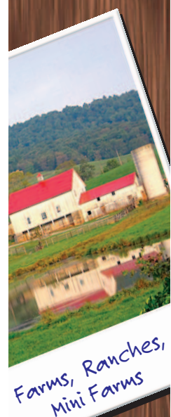
Farms, Ranches, Mini Farms

Having trouble finding that perfect piece of property?