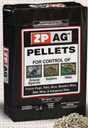
Restricted Use Product

ZP Ag is available in various forms (Pellets, Oats) and can be broadcast in many different applications, including Grass Grown for Seed and Orchards.