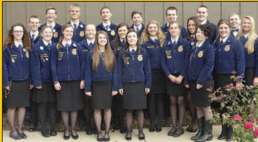
Meridian, Idaho, FFA members pose for a group picture while at the National FFA Convention in Louisville, Kentucky.