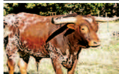
Bull Registered Texas Longhorn: 4 years old, sires great calves, lots of color, $2,500. Molalla, OR. 503-349-4985

Bred Longhorn Cow: 4 years old, brown and white paint, good quite cow, has great calves, $1,500. Molalla, OR. 503-349-4985