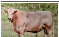
Mastel Family Murray Greys: Cows, heifers & bulls. Roseburg, OR. 541-679-0677

Hereford March yearling bull. Dark red, eye pigment, stout and thick. Ready to work. Hannan Family Farm, Molalla, OR. 503-651-2973.