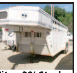
Taking Orders Wilson Ranch Hands