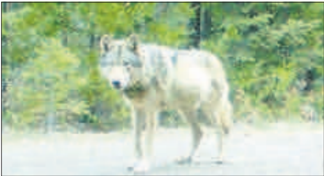
Oregon Department of Fish and Wildlife

Oregon Wild, an environmental group, filed a legal complaint claiming the Forest Service should have supplemented its environmental as-