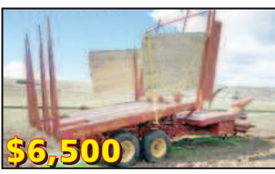
$6,500 New Holland 1032 Bale Wagon Pull type, tandem axle, 13'8" clearance for stacking, stack size 2 wide x 7 high, handles 69 14x18x36 bales or 55 16x18x46 bales.