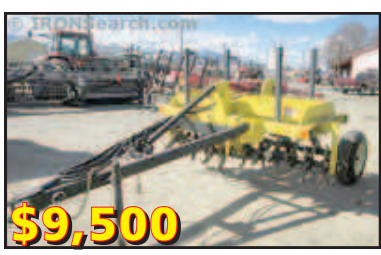
$9,500 Aerway PT7200 Aerator 10' W, no weights, tires 9.5L-15L at 90%.