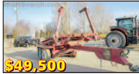
$49,500 2009 Pro Ag Designs 16k Bale Stacker Tandem axle, handles 3x3, 3x4 or 4x4 bales, hitch realigns for transport. Stk# UBA1886