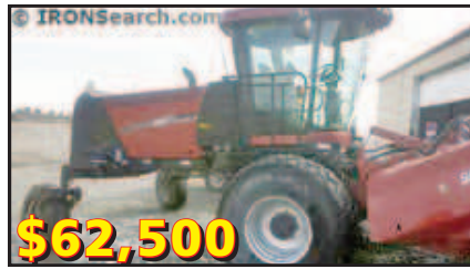
$62,500 2006 Case IH WDX2302 Swather 1660 hrs, 225 hp, 16' W, cab, diesel, 16' rotary header, single conditioner, steel on steel conditioner rolls, drive type PT/SP. Stk# UBA1903

The industry's leading baler leads the way again.