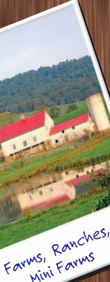
Farms, Ranches, Mini Farms

Having trouble finding that perfect piece of property?