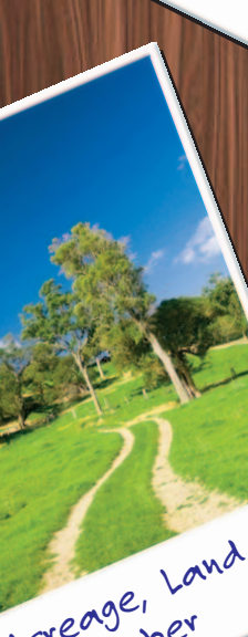
Acreage, Land, Timber