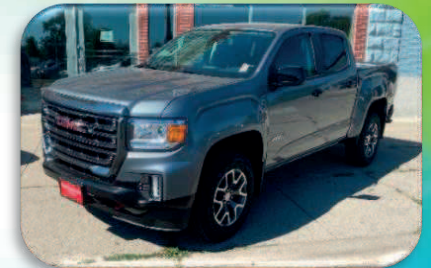
2022 GMC Canyon AT4 CREW CAB $44,065.00