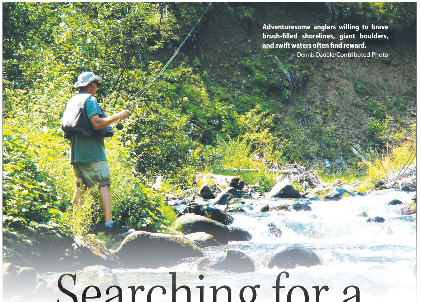
Adventuresome anglers willing to brave brush-filled shorelines, giant boulders, and swift waters often find reward.

Crappie fishing should still be good in places around the region as summer wanes.