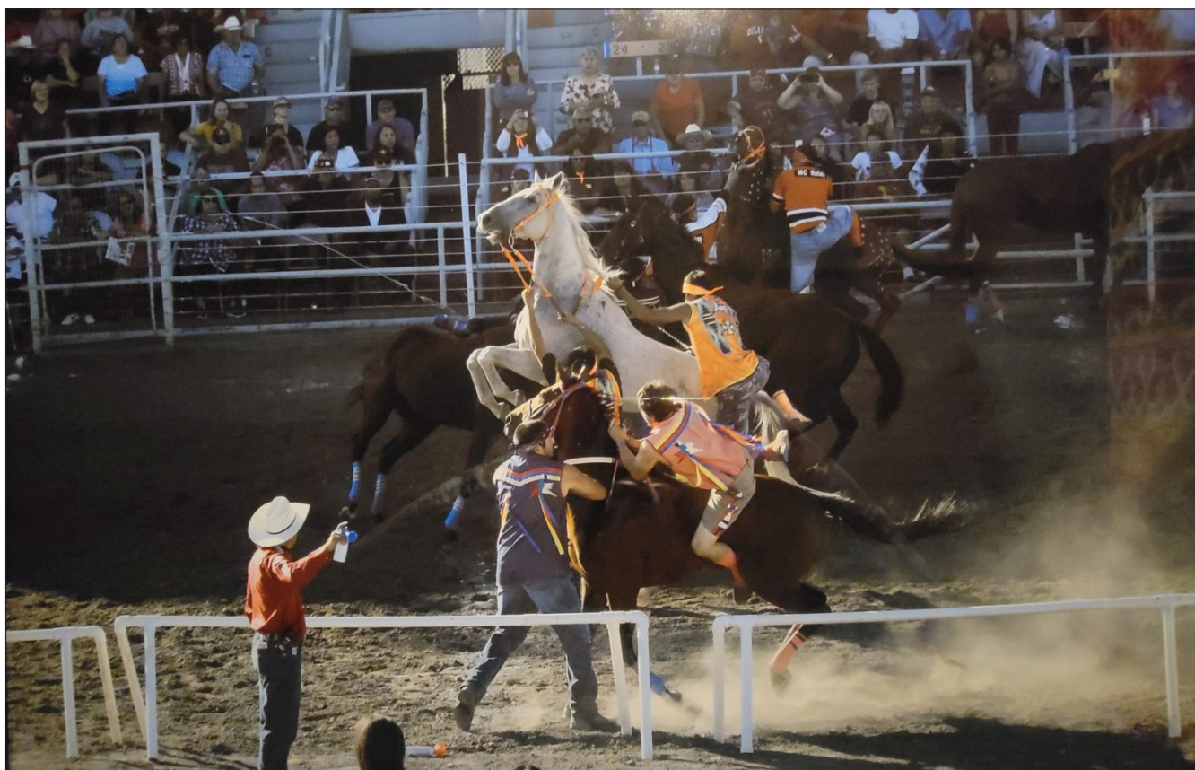
A framed Indian relay race photograph by Dallas Dick is one of two prizes for a Friday, July 29, 2022, raffle benefitting the Josephy Library of Western History and Culture Exhibits. Purchase tickets at www.josephy.org/event/native-sport-affle .