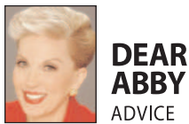
DEAR ABBY ADVICE

DEAR ABBY: I recently posted on Facebook about how I never get any recognition from my only son on my birthday, Mother's Day or any holiday. My daughter-in-law then responded that I care more about my dogs than my grandchildren. I live in Florida; they live in Kansas. Last year, I offered to fly the girls to Florida for a visit but was told no. I have asked that they come for a visit, but no visits have happened.