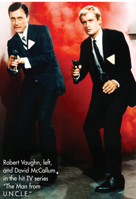
Robert Vaughn, left, and David McCallum in the hit TV series "The Man from U.N.C.L.E."